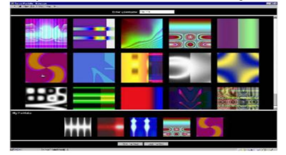
Fig 1.Graphical Authentication Scheme 1

But this system is vulnerable to shoulder-surfing.