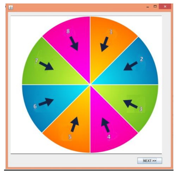
Fig4 .Login Phase

When the user request for the login system it displays the circle consist of 8 sectors filled with different colours as shown in snapshot given below fig 4.